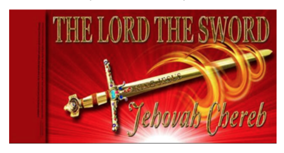
Fear & Control Revisited