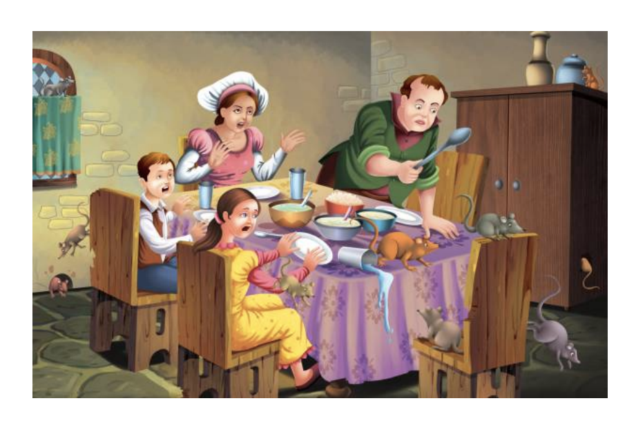
A plague of Egypt tormented the city

13. Have you heard the story of the Pied Piper of Hamelin? Well you will never hear it like this.